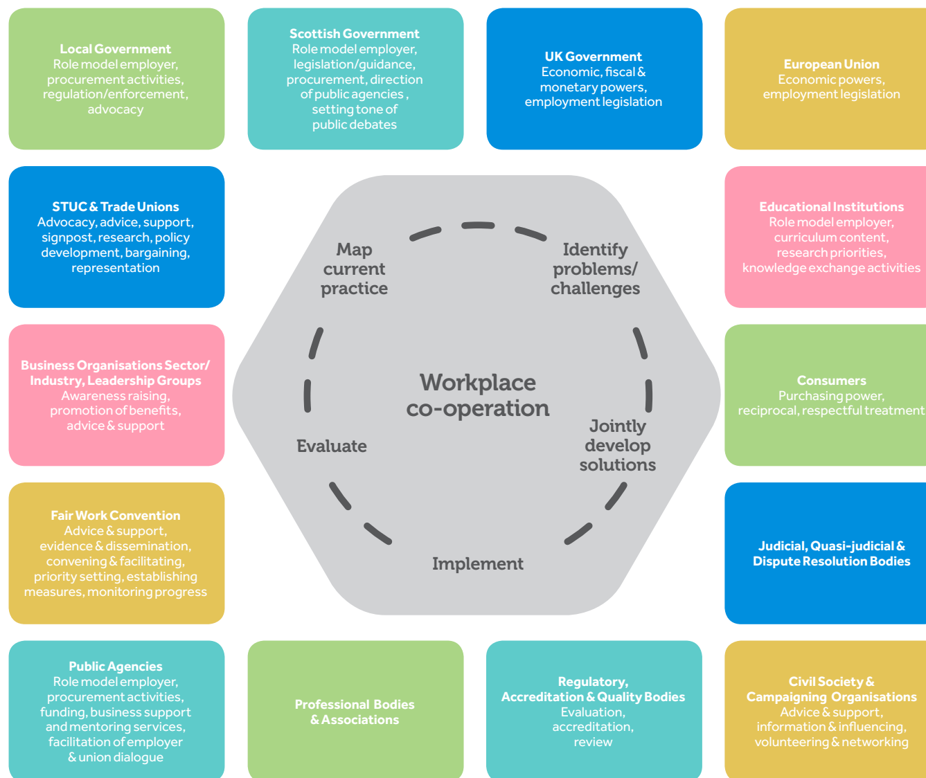
Scotland's fair work landscape: Stakeholders and levers